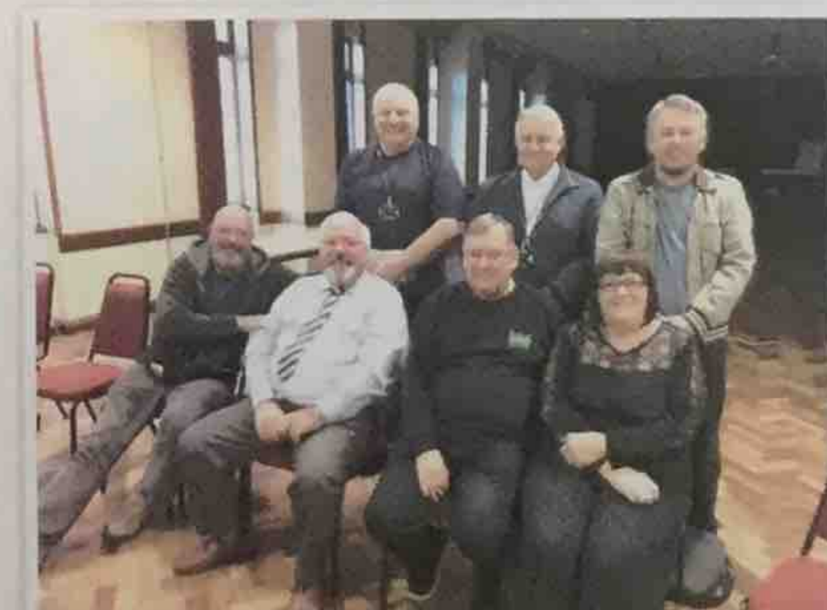
Local Councils working together for the benefit of the area.