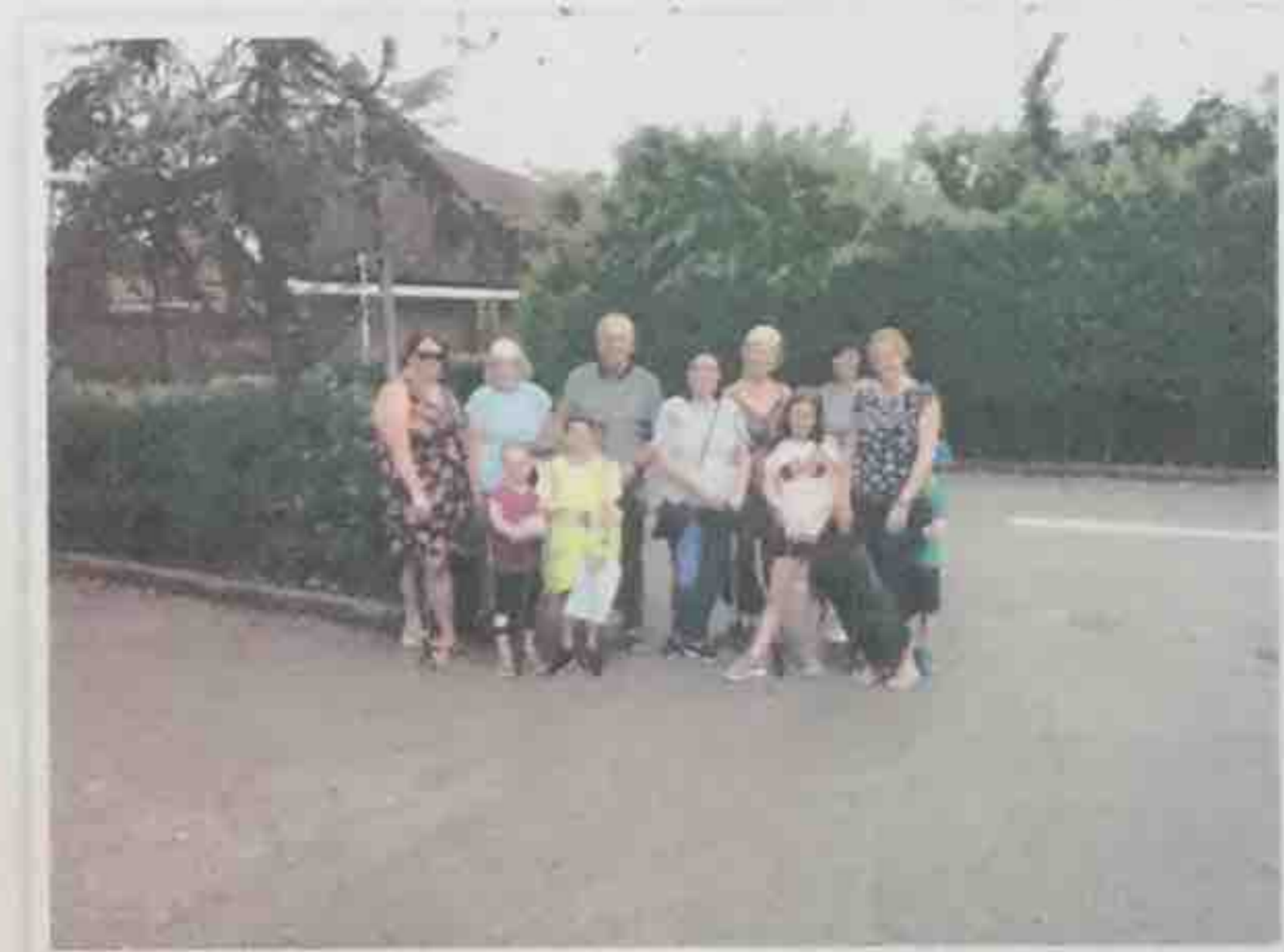
Our busy litterpicking group.